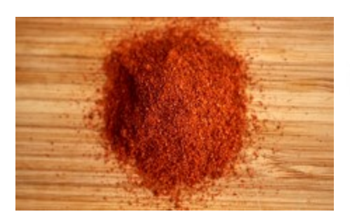
Cayenne Pepper or Black Pepper