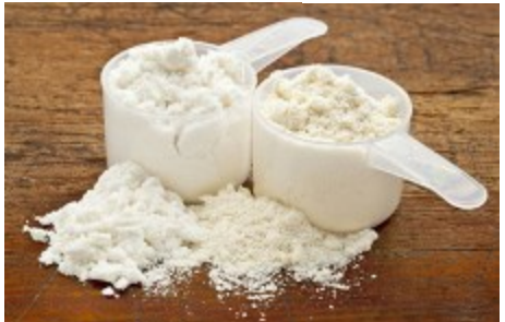
Food-Grade Diatomaceous Earth