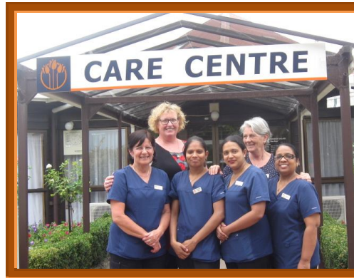
Ons Dorp Staff members